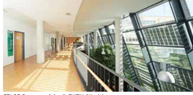
ETAGE Innenansicht